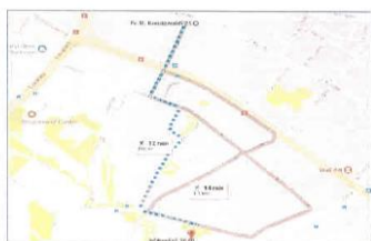
JUHKENTALI HOUSE Juhkentali, 36