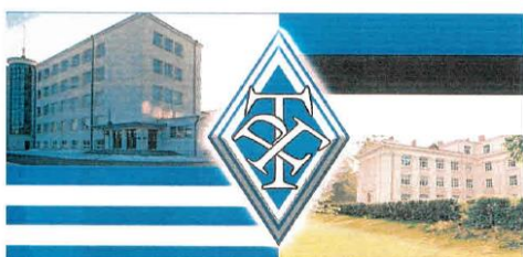
LENDER HOUSE Fr.R.Kreutswaldi, 25